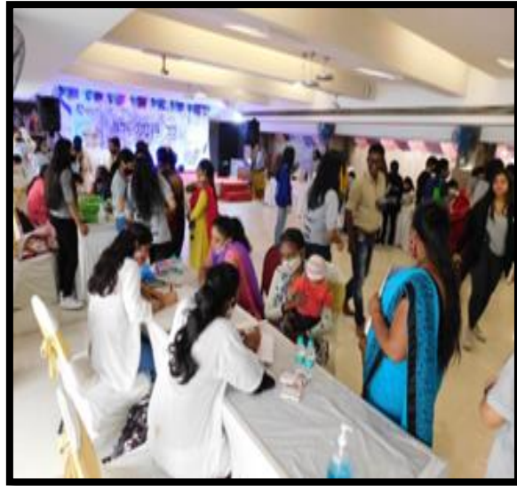
Health Check up camp