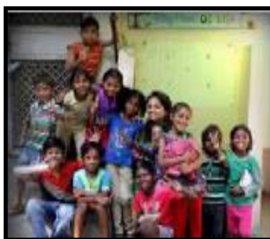
Distribution of refreshments and stationery to under privileged children