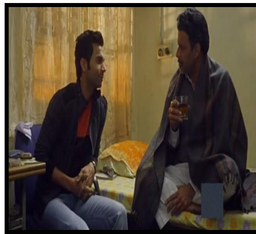
Clip of a movie